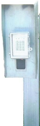
Card Reader Bollard for car & Truck options