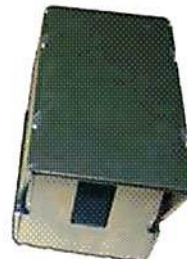
Safety photo electric beams Send-receive reflector type